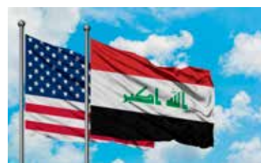
Staff at the US embassy in Baghdad were told to leave

The US military's Central Command also talked of "identified credible threats available to intelligence from US and allies".