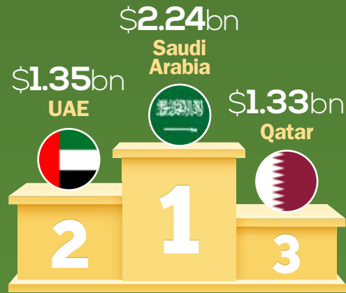
PROJECTS Leading countries by value of active and planned sports projects